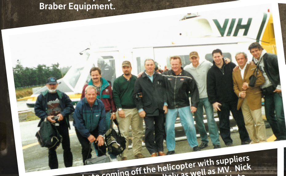
Group photo coming off the helicopter with suppliers including Comet Pumps from Italy as well as MV. Nick liked rewarding our suppliers with trips like this to Langara fishing lodge in the Queen Charlotte Islands in Northern British Columbia.